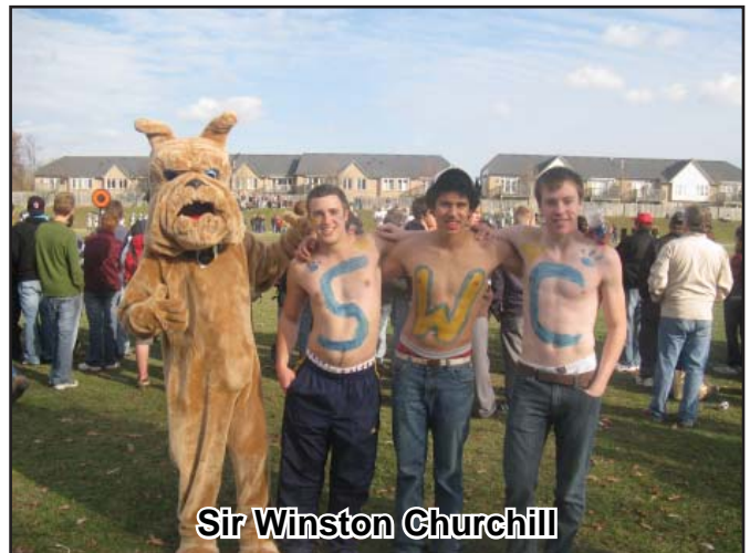
Sir Winston Churchill